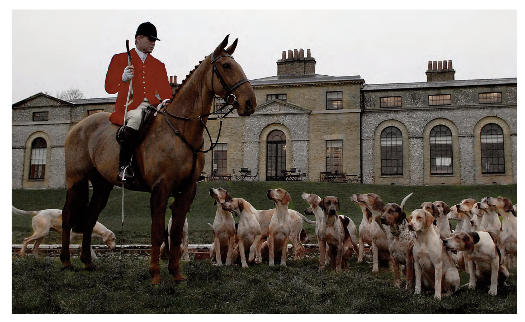
A meet at The Kennels of the Chippingfold, Leconfield & Cowdray Hunt