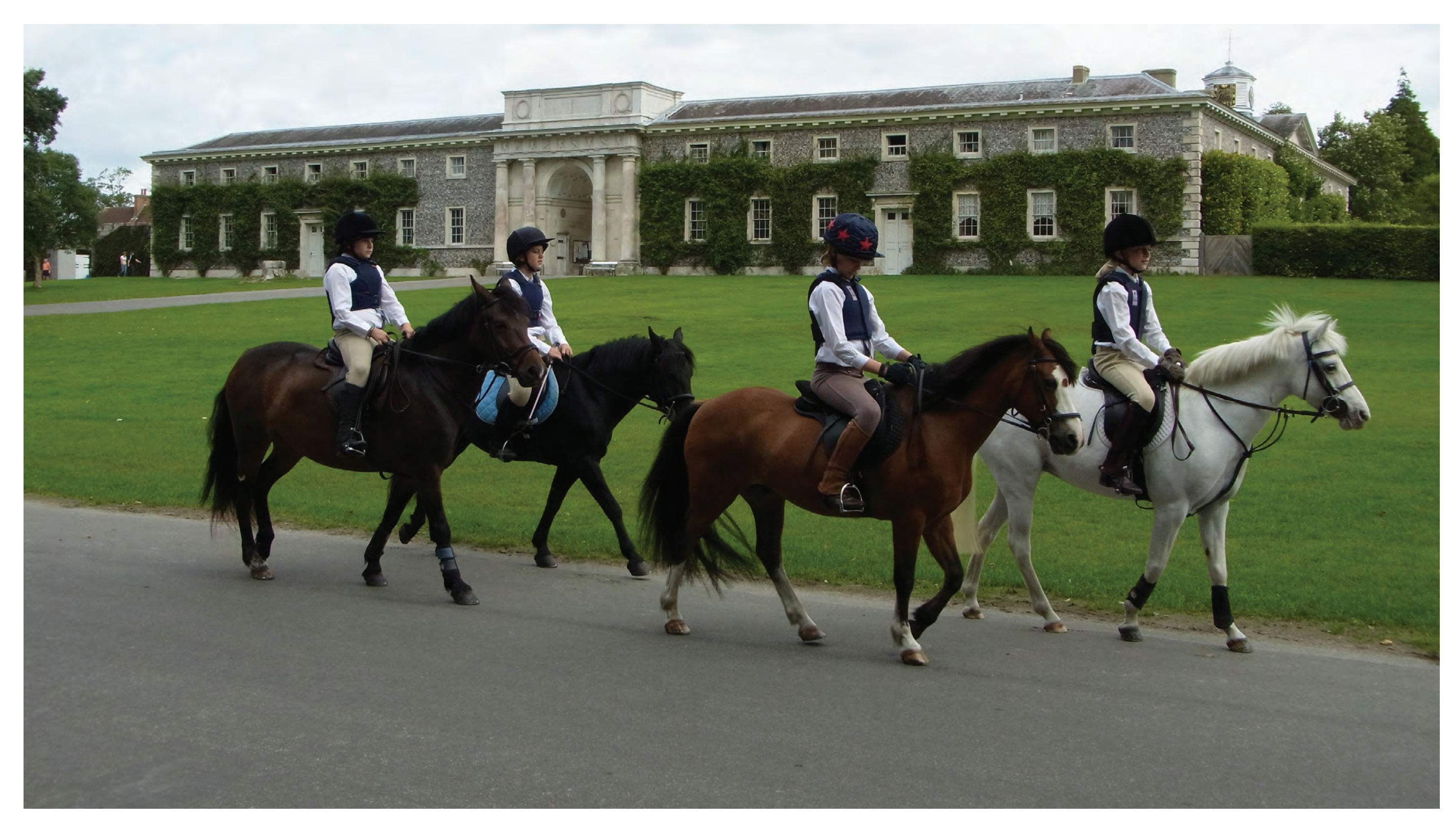
Members of the Goodwood Pony Club