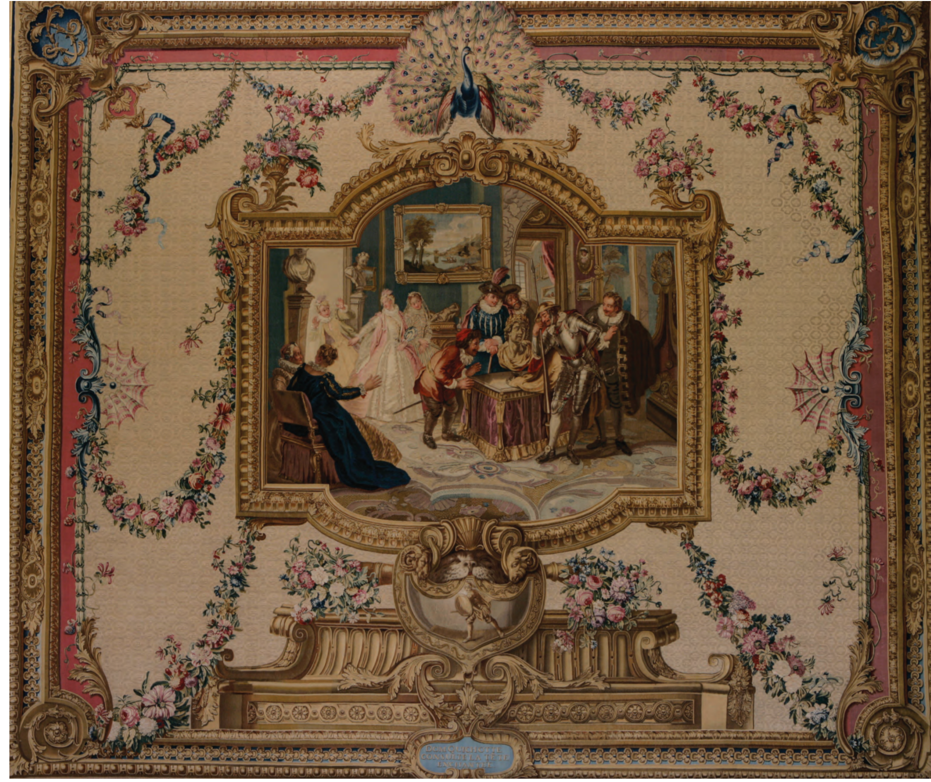
Gobelins tapestry with Don Quixote and the Enchanted Head , 1763.