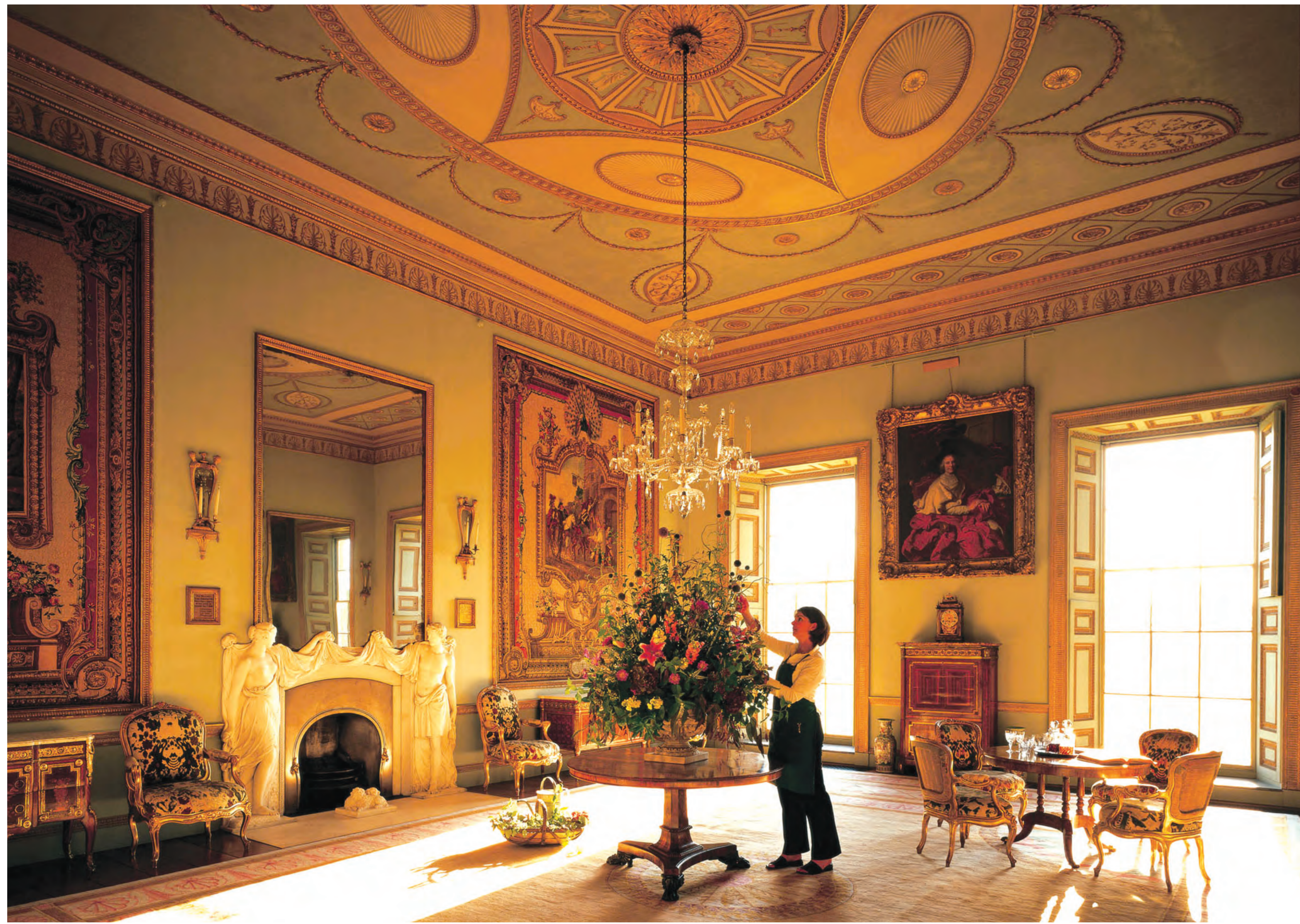
The Tapestry Drawing Room showing the secrétaire à abattant (fall-flap desk) by Franz Rübestück between the windows.