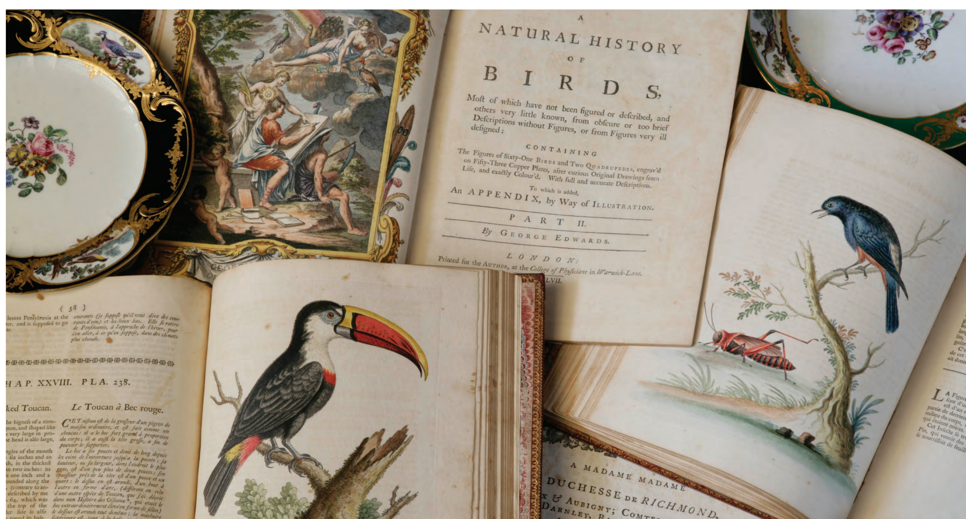
The Natural History of Birds illustrated and written by George Edwards. The first volume (1745) of the French edition was dedicated to the 2 nd Duke of Richmond, and the second volume (1748) to the Duchess (seen here lower right). Plates from the Sèvres service, on which the birds were copied, can be glimpsed.

The 2 nd Duke was very nearly sent as British ambassador to Paris in 1748, an appointment to support the renewed relationship with France following the peace treaty of Aix-la-Chapelle to end the War of the Austrian Succession. The Duke made lists of the servants he would need to take with him, the final list numbering sixty-nine! In the end, he was never made ambassador, owing it seems to a French nobleman of lower rank being sent to London, and his brother-in-law, the 2 nd Earl of Albemarle was sent instead. He seems to have been relieved by this, particularly as he was worried about the finances, writing to the Duke of Newcastle in February 1749: ‘... I am extremely happy in being quitt of an employment I never liked’.