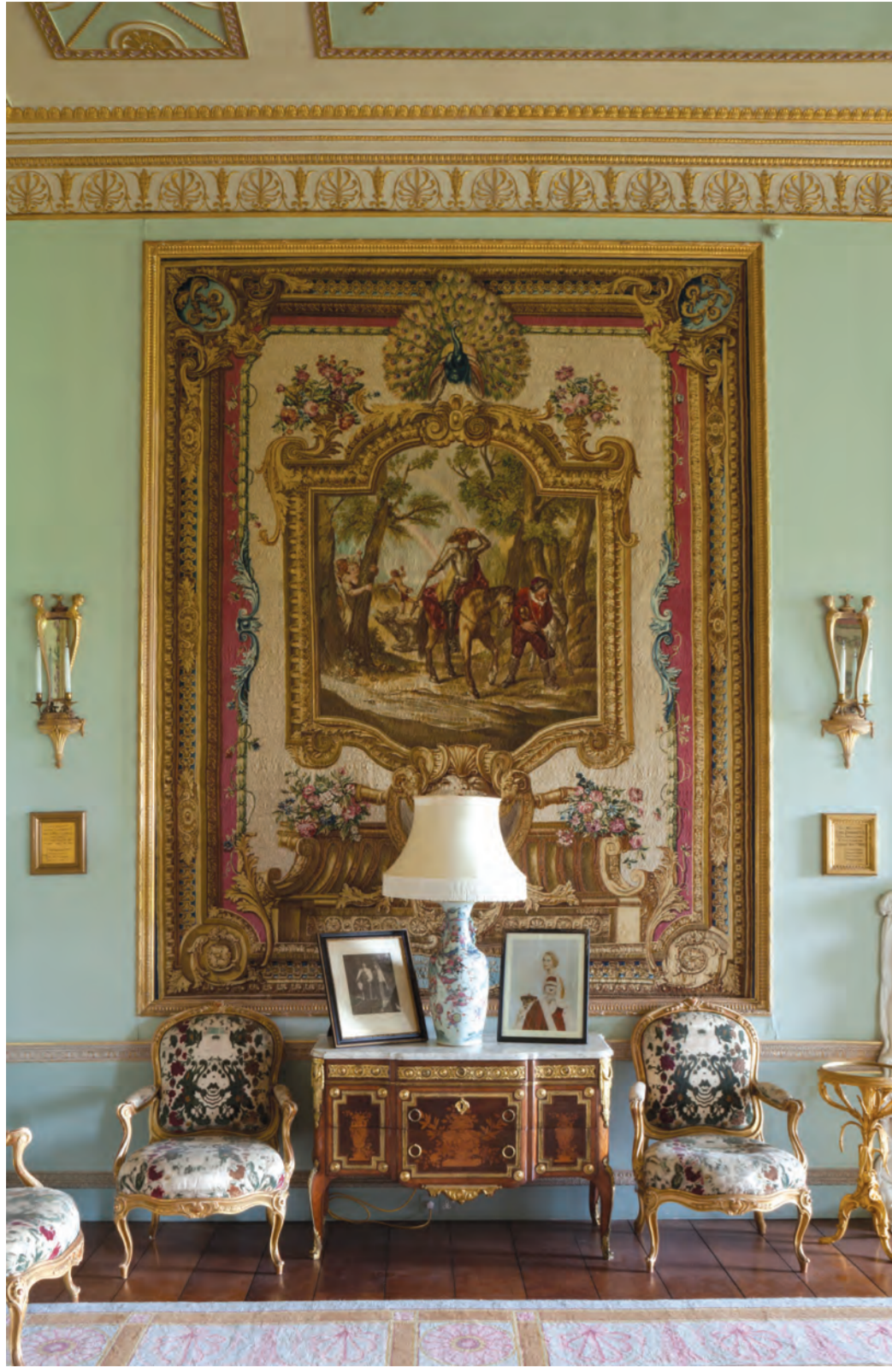
Gobelins tapestry with Don Quixote wearing a shaving dish , 1764. The late Louis XV commode is stamped by Antoine-Leonard Couturier and Louis Moreau.