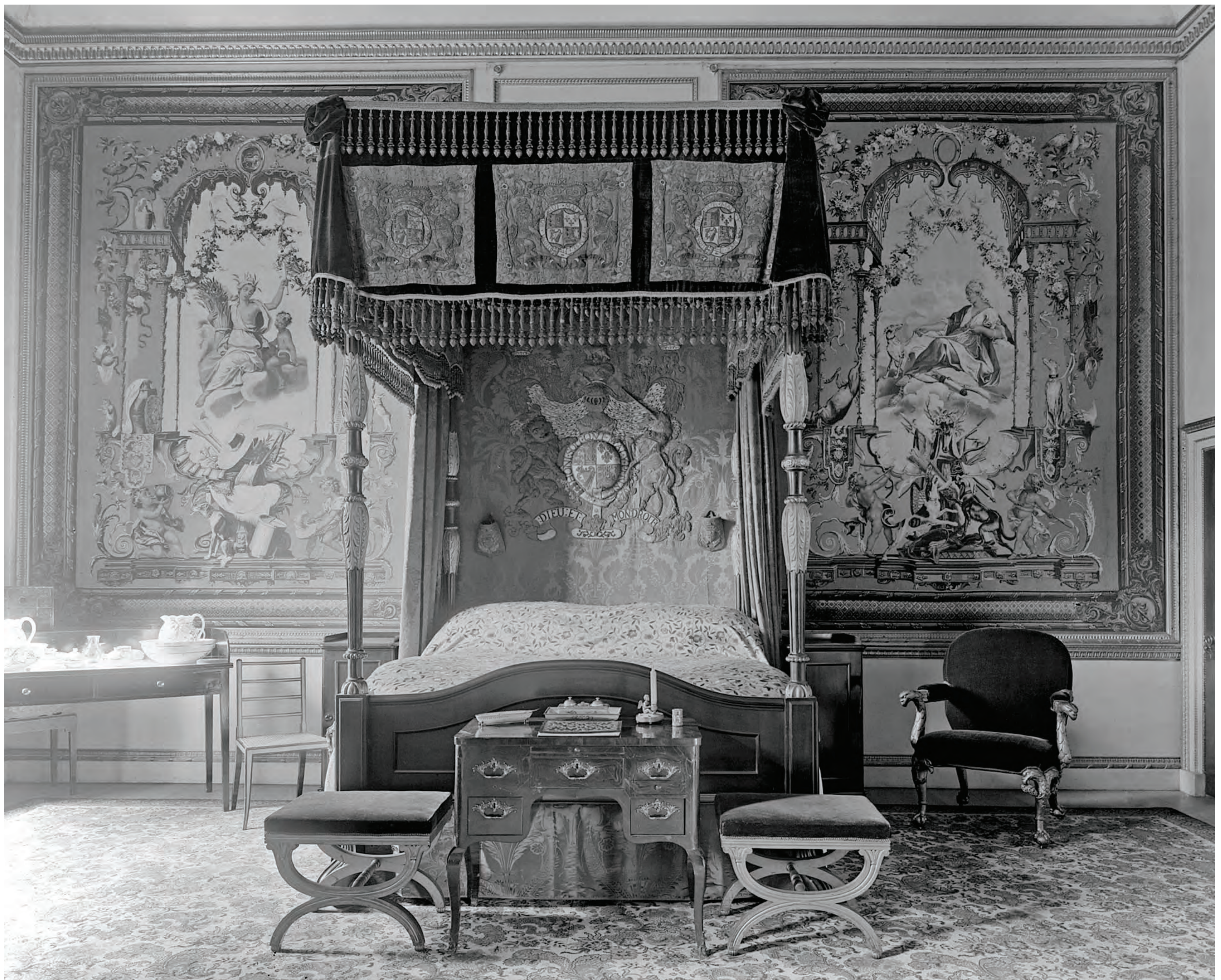
The Tapestry Bedroom, with tapestries from Les Portières des Dieux series, photographed in 1932. The room was demolished in the late 1960s.