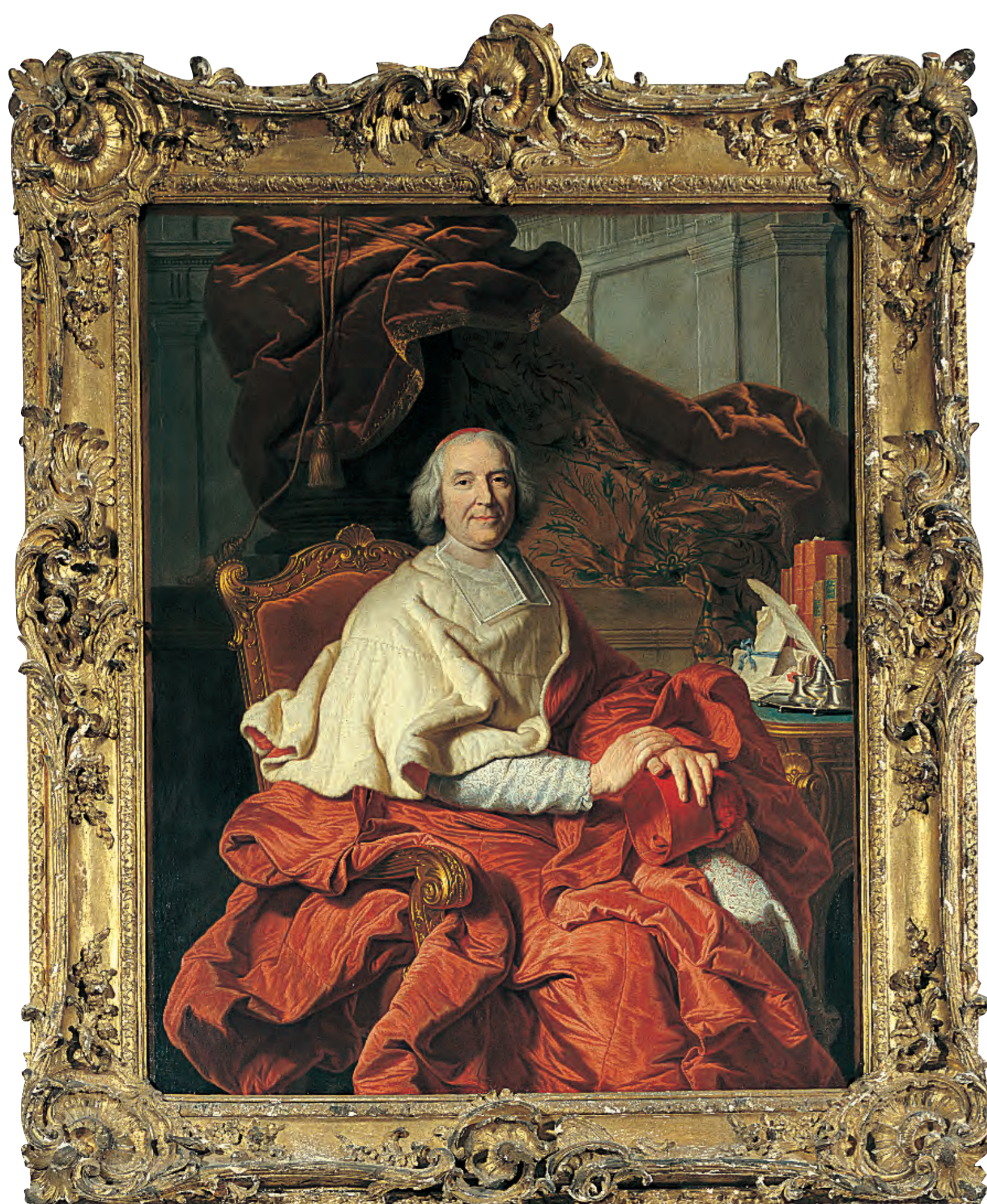
Cardinal Fleury by Hyacinthe Rigaud.

Later that week the French King presented the 2 nd Duke with two fine Turkish Horses and a fine set of Barbs for his Coach. The portrait is displayed in a magnificent French giltwood Rococo frame, circa 1740.