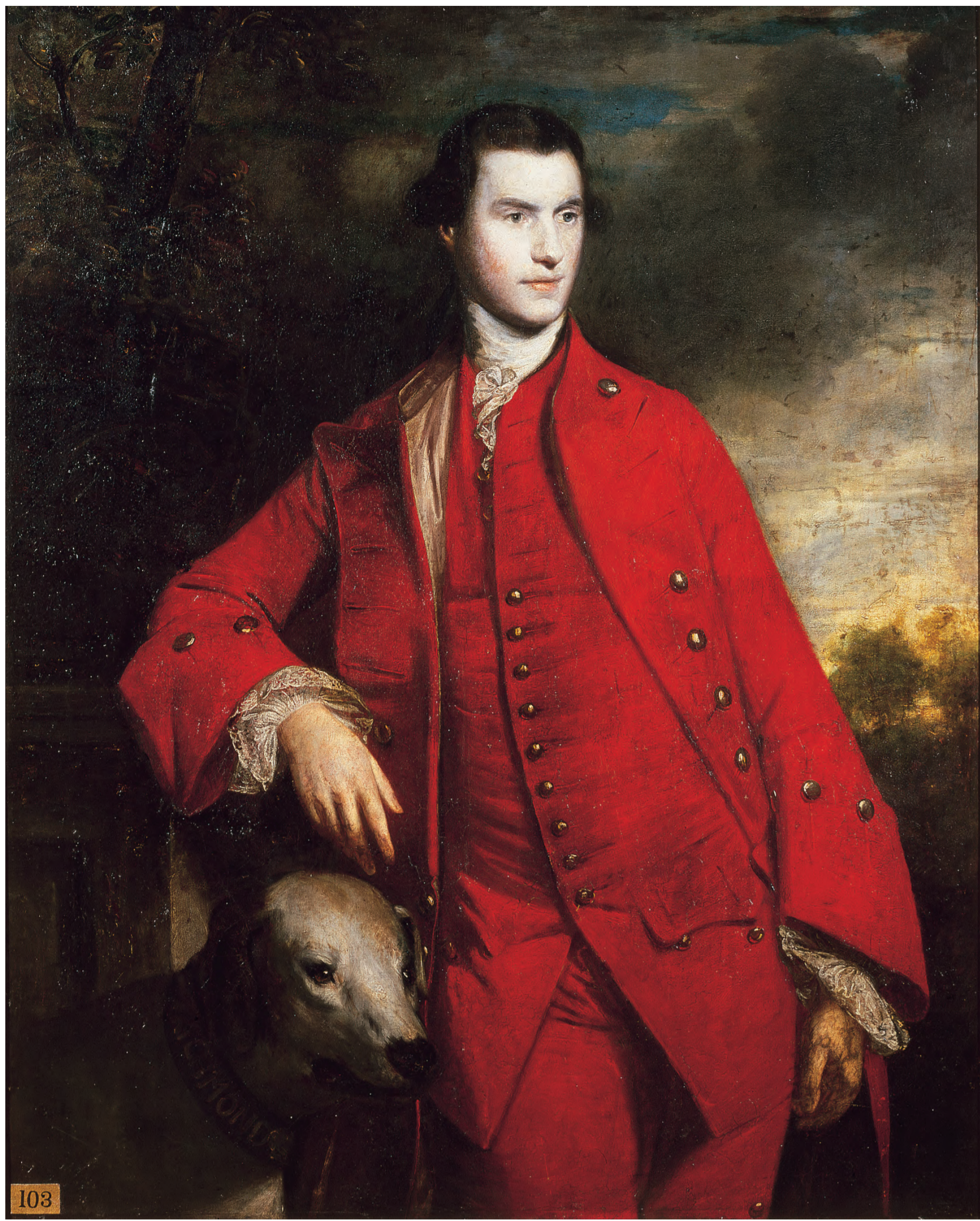
Charles, 3 rd Duke of Richmond by Sir Joshua Reynolds (1758).