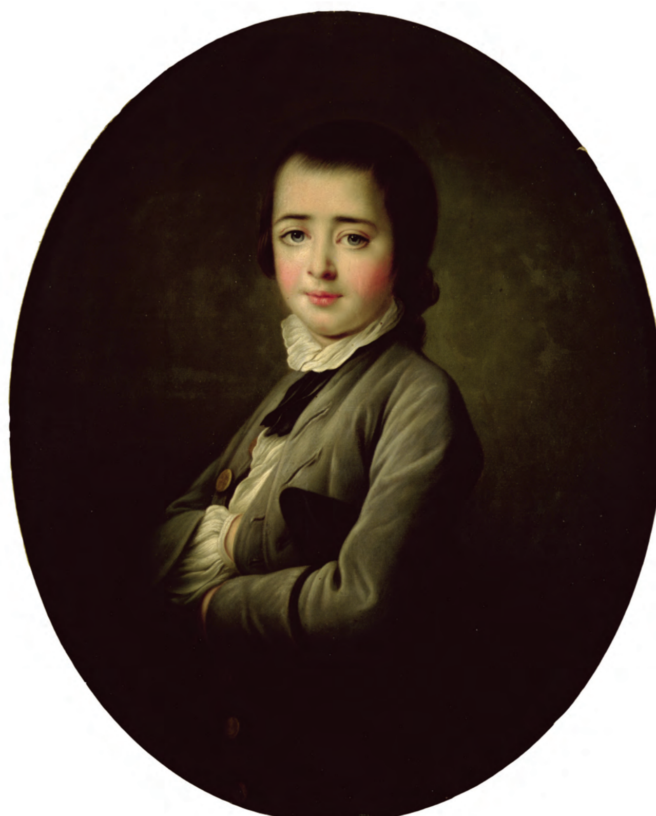
The Hon. Henry Edward Fox attributed to François Hubert Drouais.