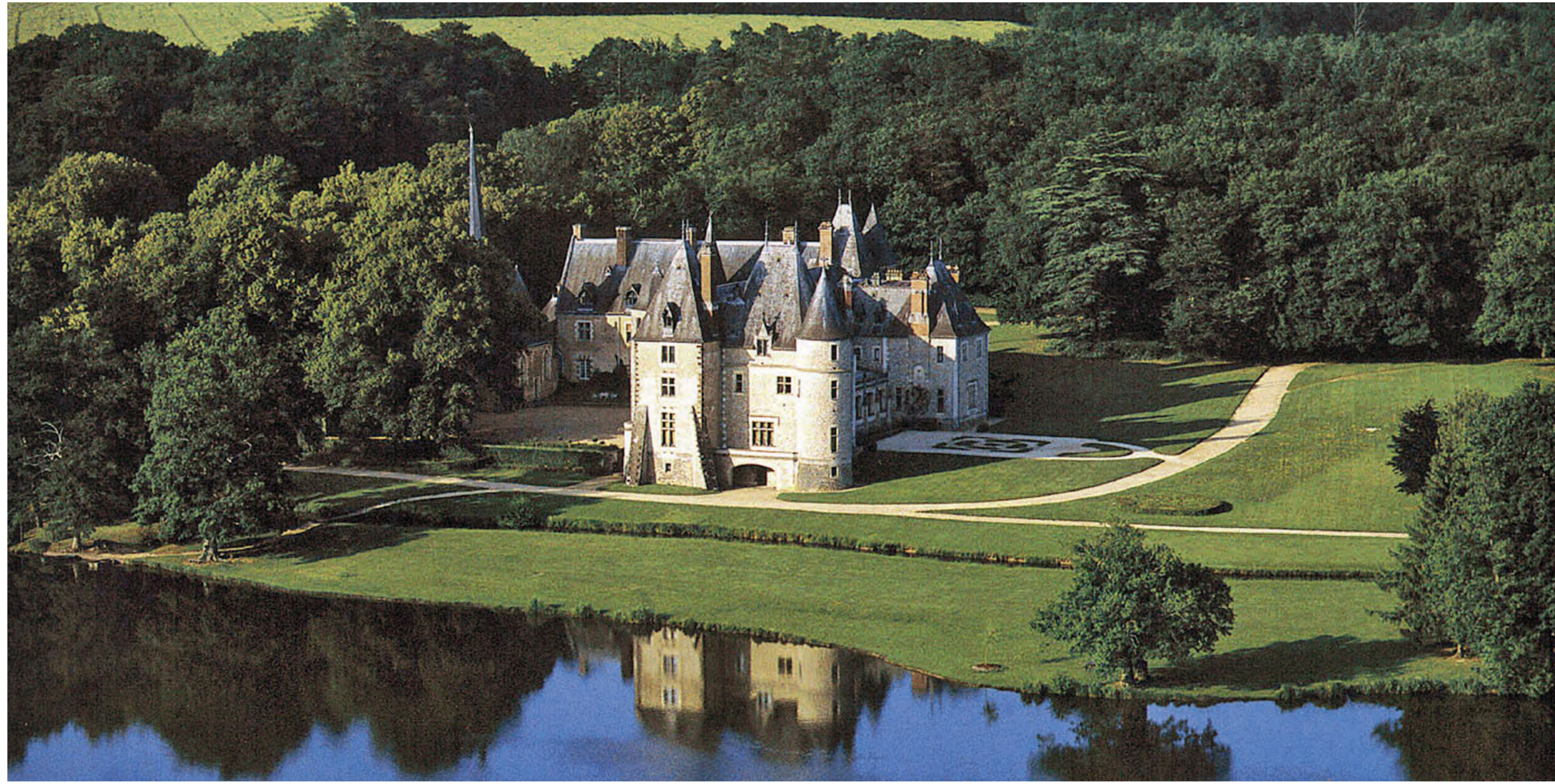
The Château of La Verrerie, Aubigny, granted to Louise de Keroualle in 1673 and owned by the Dukes of Richmond until 1842.

When Charles II died in 1685, Louise returned to France, taking with her two ships filled with treasures from her Whitehall apartment. Twelve years earlier, Louise had been granted the ancient Stuart estate at Aubigny-sur-Nère, east of Orléans and in 1684 she was made Duchess of Aubigny. The estate included the romantic Château of La Verrerie where Louise lived happily for nearly fifty years. When she died in 1734, it passed to her grandson, the 2 nd Duke of Richmond (who also became Duke of Aubigny) and it remained in the family until 1842.