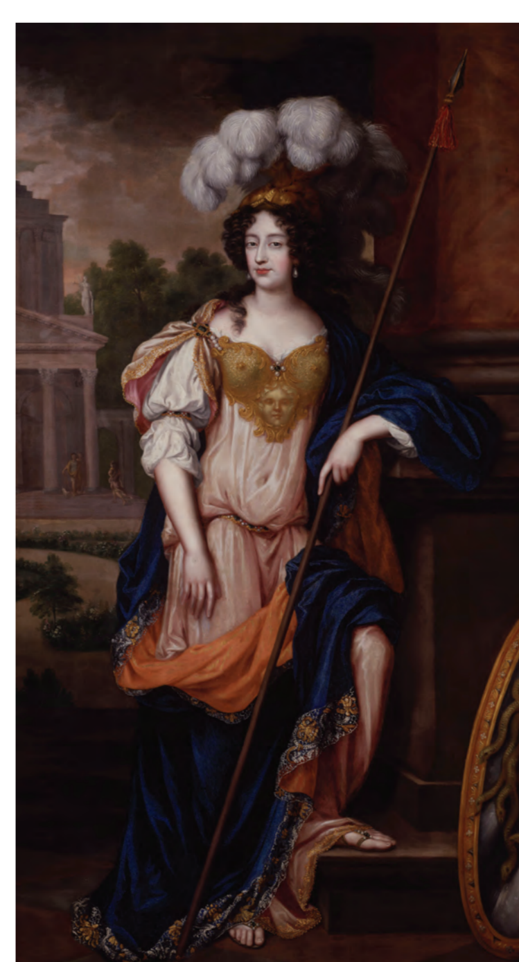
Frances Theresa, Duchess of Richmond, as Minerva , by Henri Gascars.