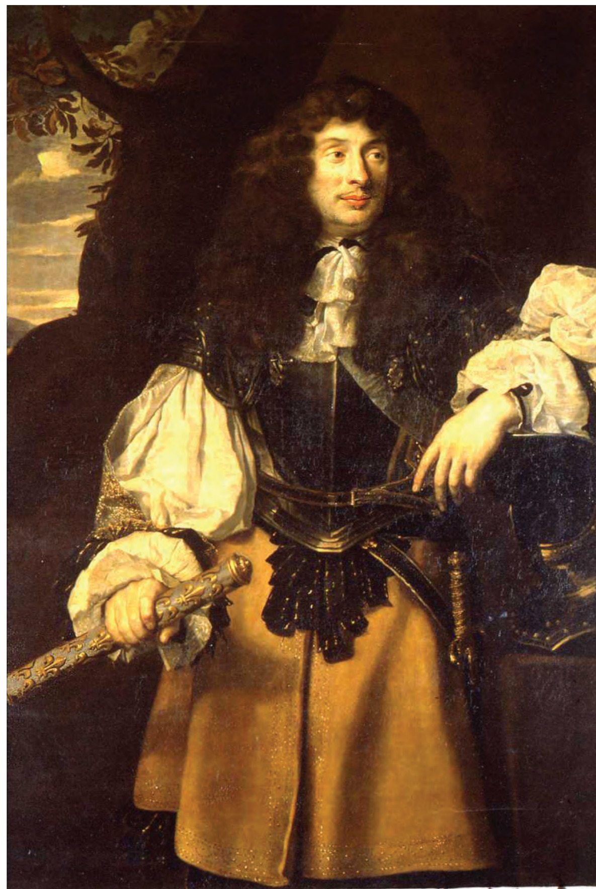
The Marquis de Castelnau, Maréchal de France attributed to Pierre Mignard.