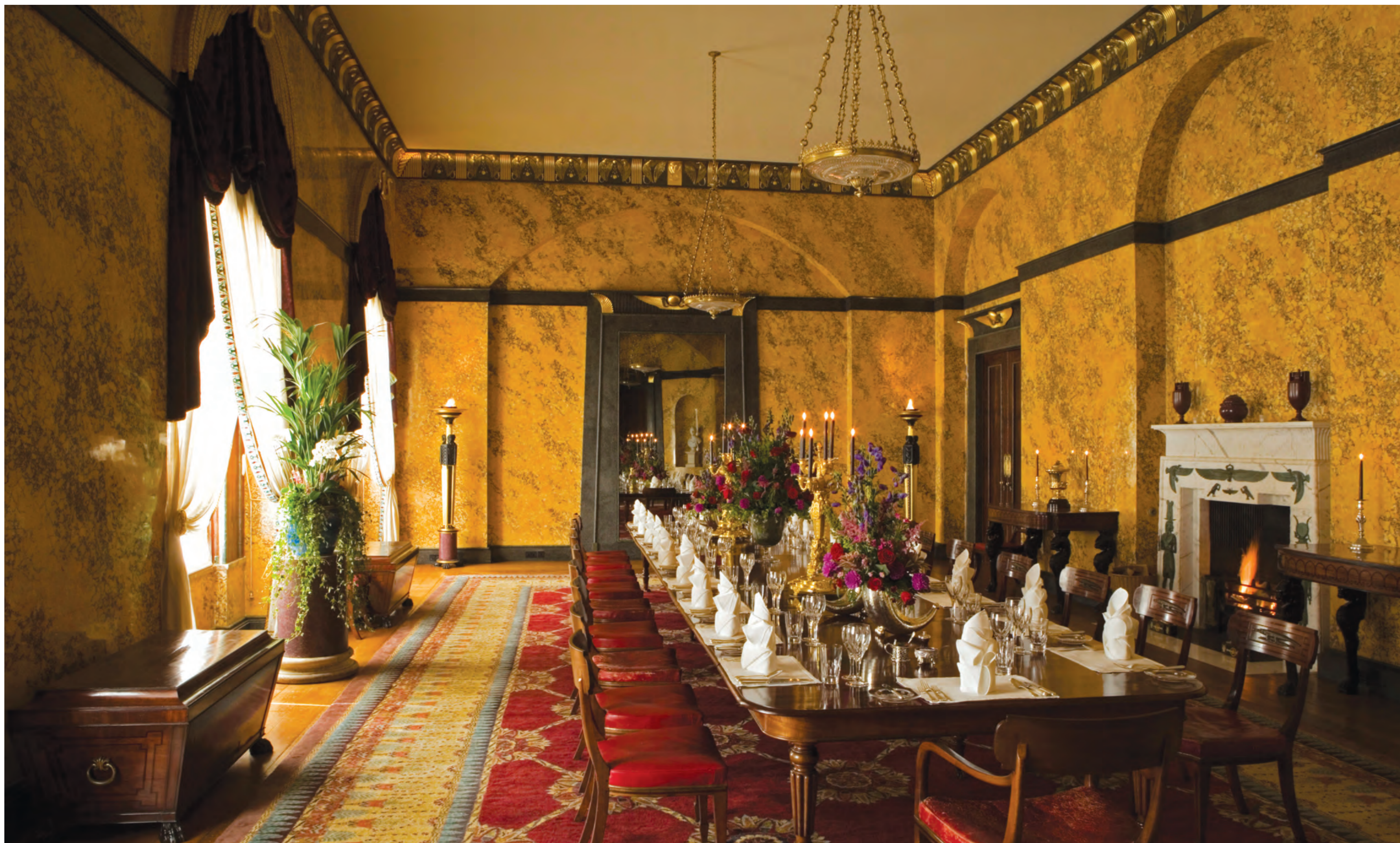
The Egyptian Dining Room with new chimneypiece re-made according to its original description with bronzes derived from Denon's engravings.