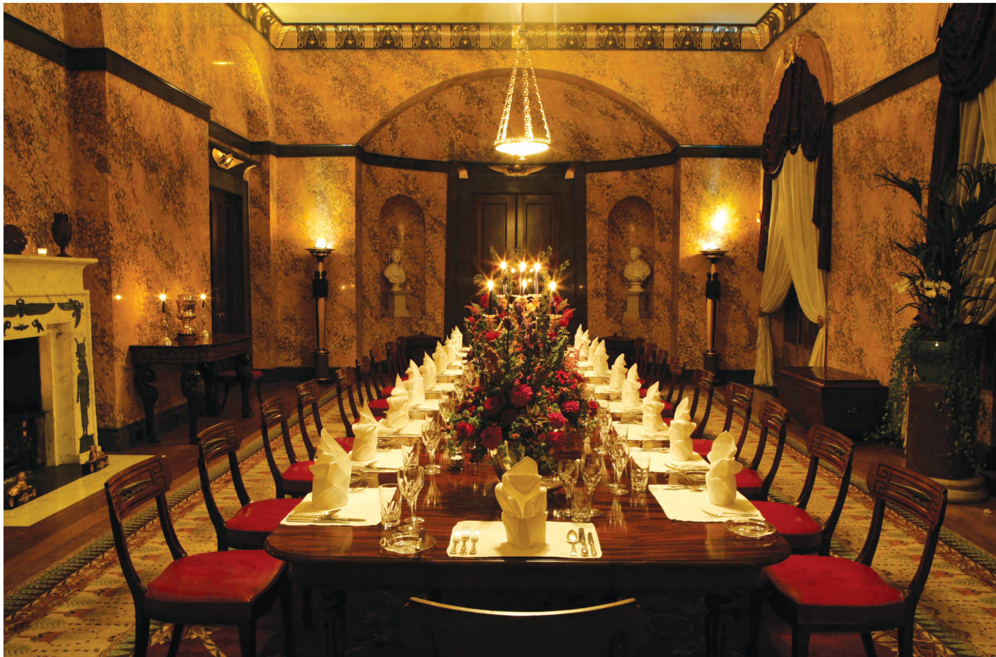
The Egyptian Dining Room.