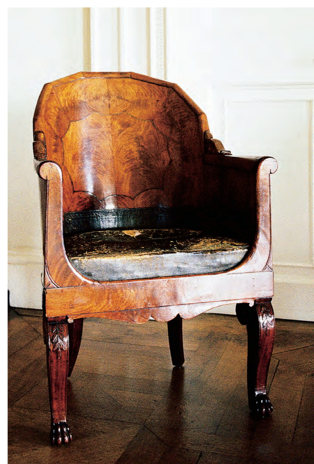
Napoleon's mahogany campaign chair, attributed to Jacob frères.