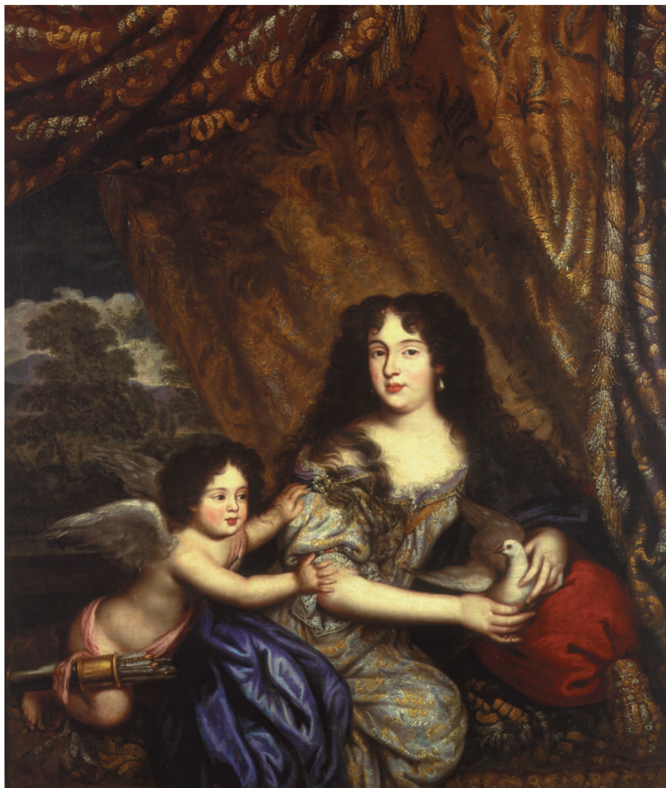
Louise de Keroualle, Duchess of Portsmouth, as Venus, with her son, Charles as Cupid by Henri Gascars.