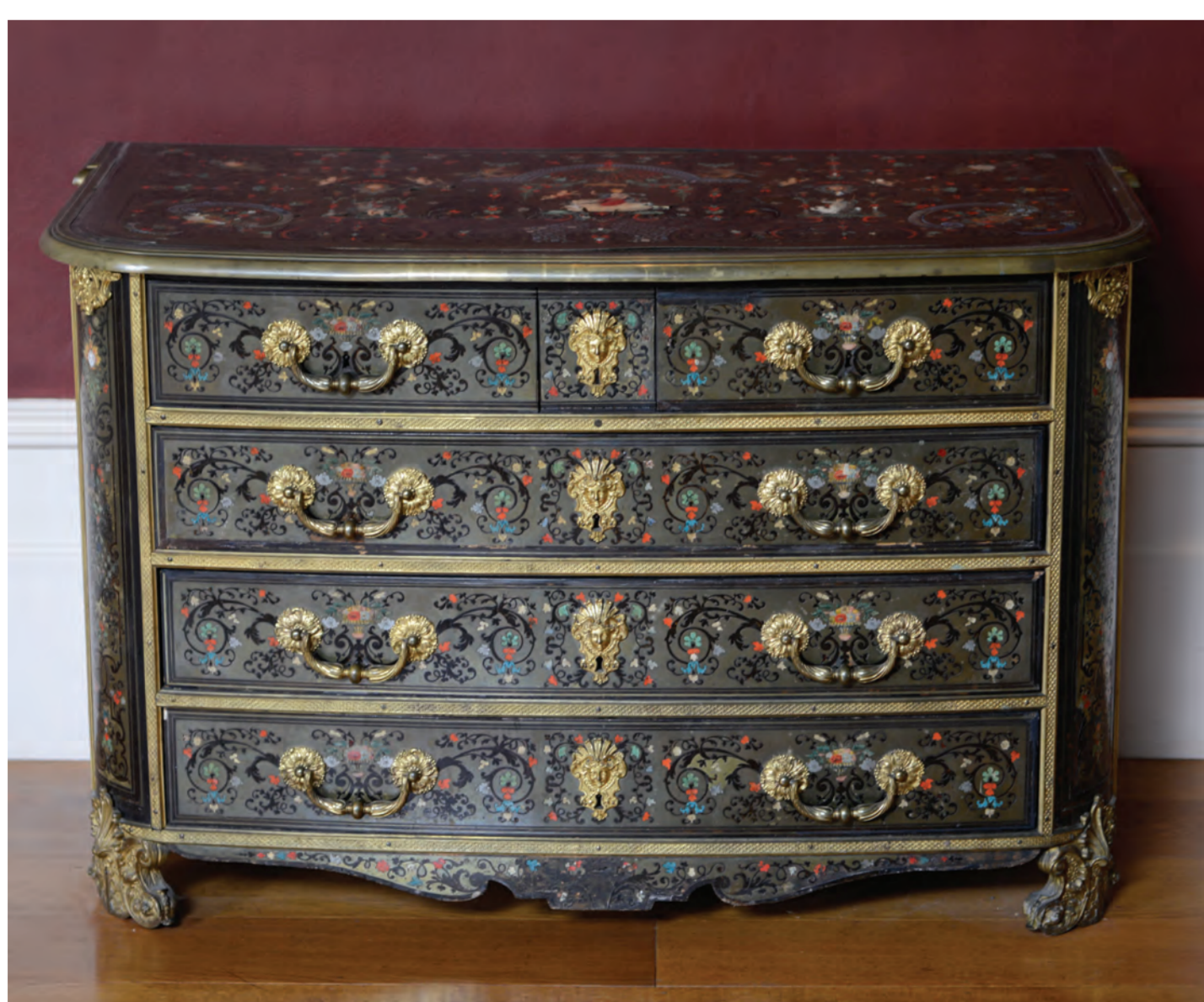
A Louis XIV brass, tortoiseshell, ebony and stained-horn Boulle commode, circa 1710, attributed to Nicolas Sageot.

Also in the Rococo style of the Louis XV period is the charming coiffeuse (lady's dressing-table) by Roger Vandercruse (d. 1799), who was known as Lacroix. It dates from circa 1770 and has a delightful geometric trellis pattern in marquetry of kingwood and harewood. Interestingly, one of the drawers is inscribed on the base '3 pièces Argentées, Poirier', showing that three silver boxes were to be made as inserts and that the item went through the hands of the famous marchands mercier (dealer in rich objects) Simon-Philippe Poirier. Lacroix's stamp also appears on a little table à écrire (writing-table) that is inlaid with marquetry flowers and foliage on delicate cabriole legs.