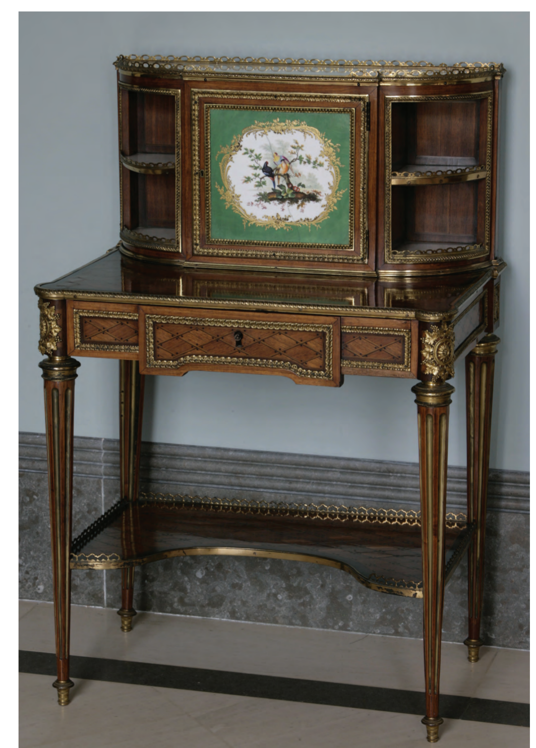
A Louis XVI parquetry bonheur-du-jour (lady's writing table) by Joseph Feuerstein, circa 1785.