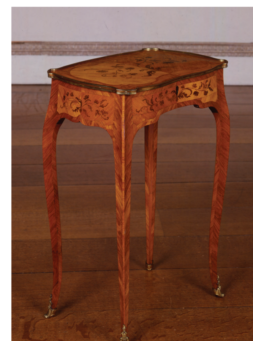
A Louis XV marquetry table à écrire (writing-table) by Roger Vandercruse.