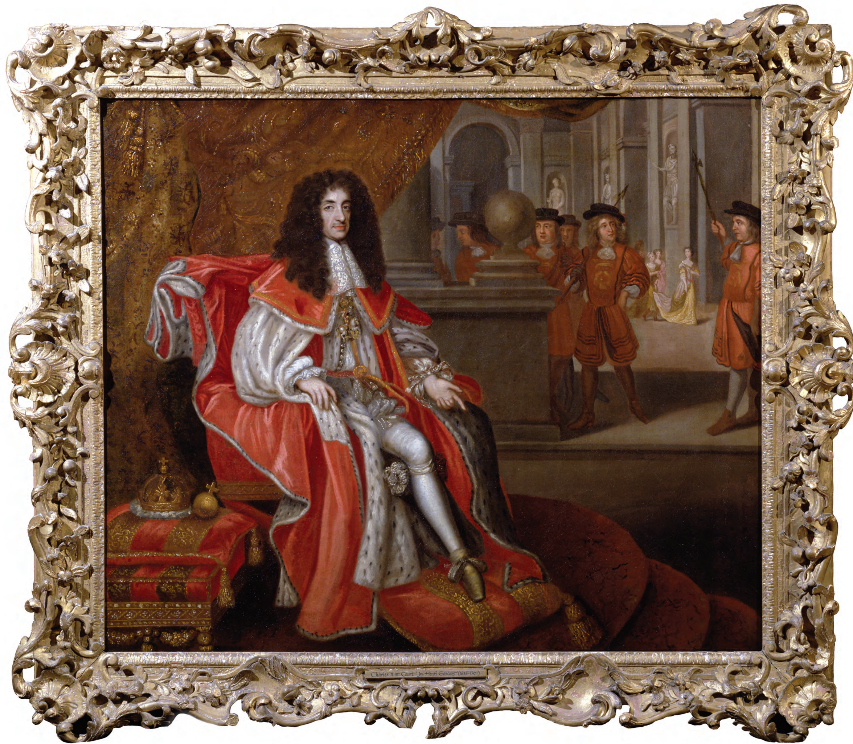
Charles II at Court by Henri Gascars. This shows Louise de Keroualle in the background.