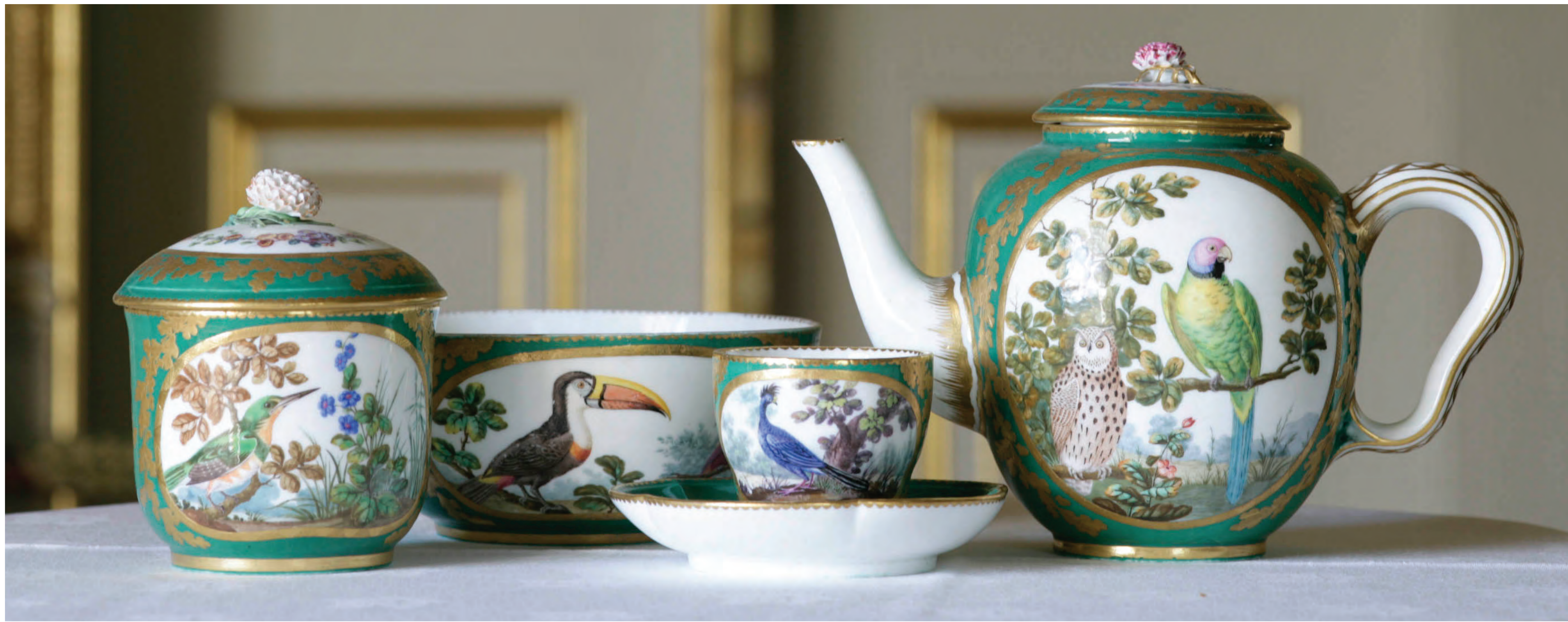
A sugar basin, slop basin, cup and saucer and teapot from the Sèvres service, commissioned by the 3 rd Duke of Richmond, 1765-66.