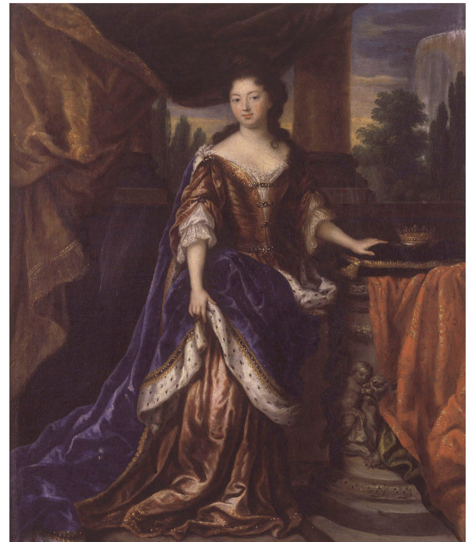
Louise de Keroualle as Duchess of Portsmouth by Pierre Gobert.