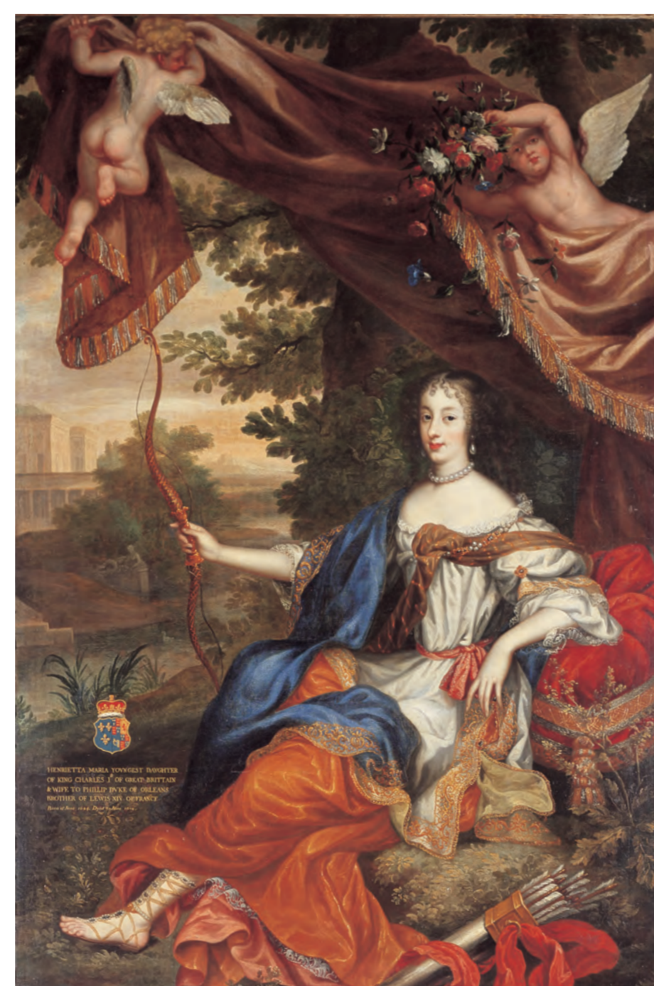
Princess Henrietta, Duchess of Orléans, as Diana, Goddess of the Chase by Henri Gascars.

younger brother, Philippe, Duke of Orleans. It was as her maid-of-honour that Louise de Keroualle first came to England for the Treaty of Dover and met Charles II. The other full-length portrait depicts Frances Theresa Stuart, Duchess of Richmond (1647-1702), one of the most beautiful women of her day. Owing to her beauty, she was known as 'La Belle Stuart' and was brought up in France in Henrietta Maria's household. When she was sent over to the English court as a maid-of-honour to Catherine of Braganza, Charles II took a great fancy to her and pursued her relentlessly until she absconded with one of his courtiers, Charles Stuart, Duke of Richmond (of an earlier creation). Gascars depicts her as Minerva, Roman goddess of Wisdom who was born from the godhead of Jupiter with weapons. In 1667, Frances Theresa was used as the model for Britannia on a medal (by John Roettiers) which celebrated the Peace of Breda, the end of the war with the Dutch; she was later used as Britannia on the British coinage.