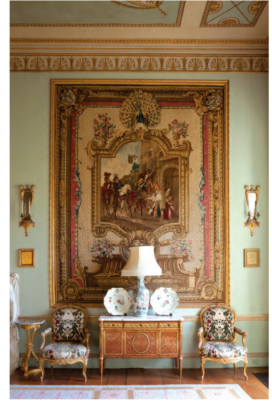
Gobelins tapestry with Don Quixote Attached to the Window by the Malice of Maritorme , 1762. The Louis XVI commode is in the manner of Ferdinand Bury.