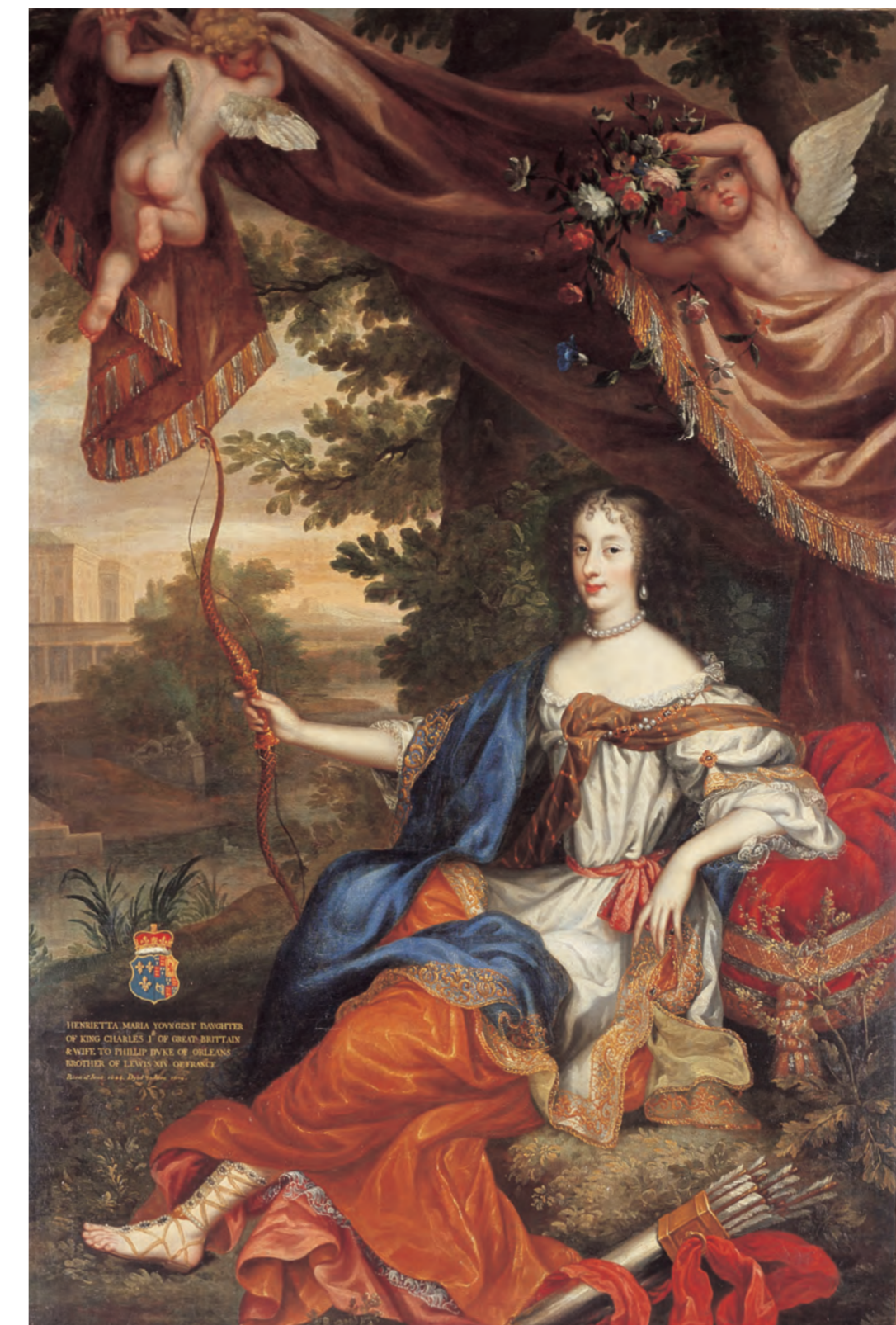
Princess Henrietta, Duchess of Orléans, as Diana, Goddess of the Chase by Henri Gascars.