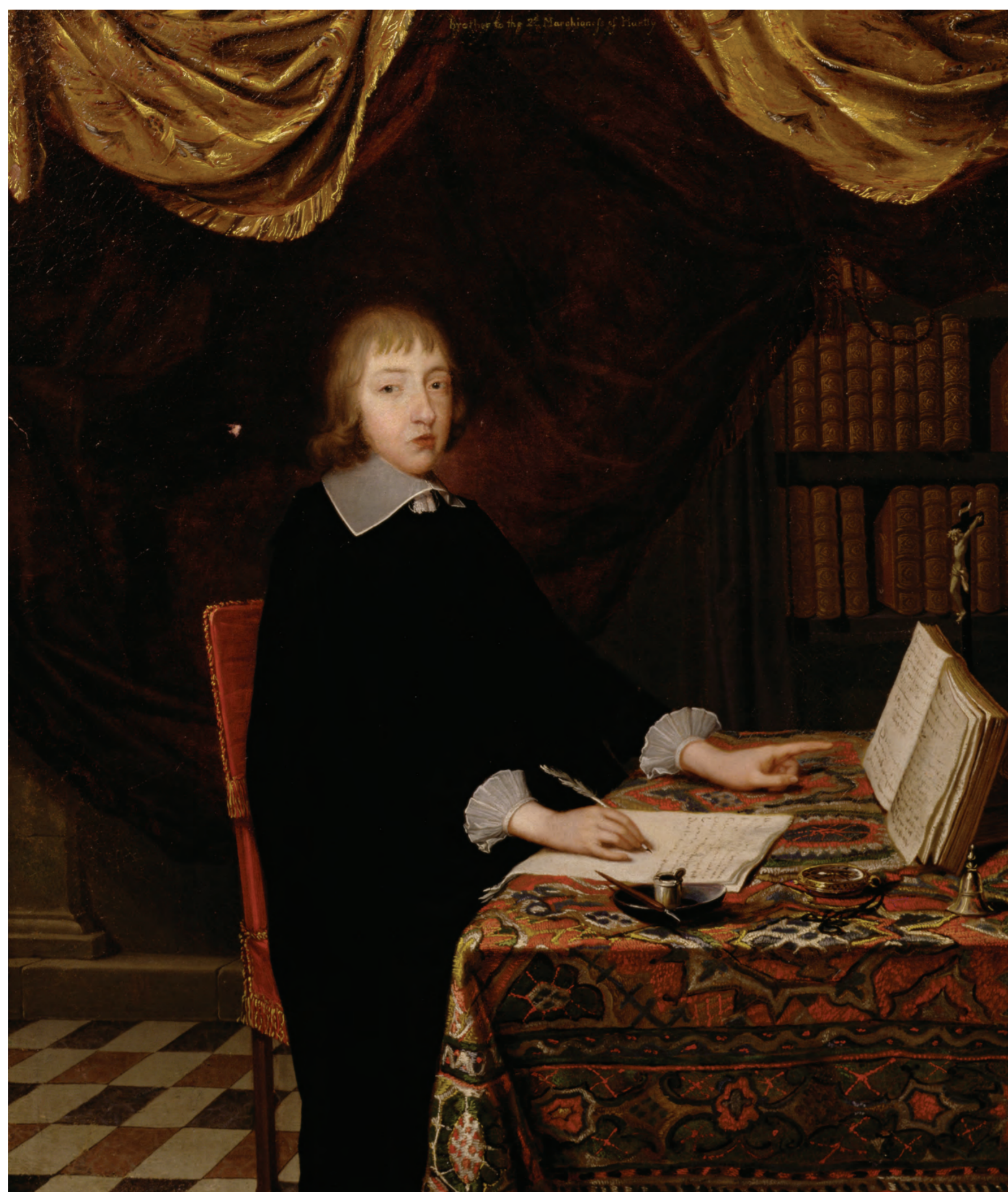
Ludovic Stuart, Abbé d'Aubigny and 10 th Seigneur d'Aubigny (French School, 17 th century).