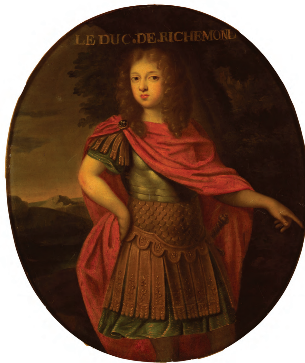
The 1 st Duke of Richmond as a Boy by Henri Gascars.