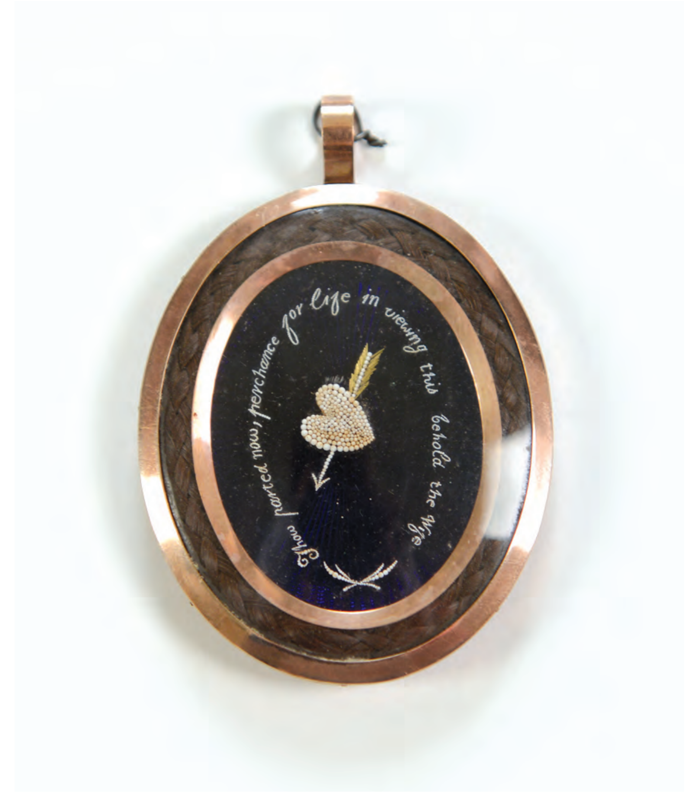
The reverse of the miniature by Nathaniel Plimer with a lock of hair and inscribed 'Thow parted now, perchance for life in viewing this behold the wife'.