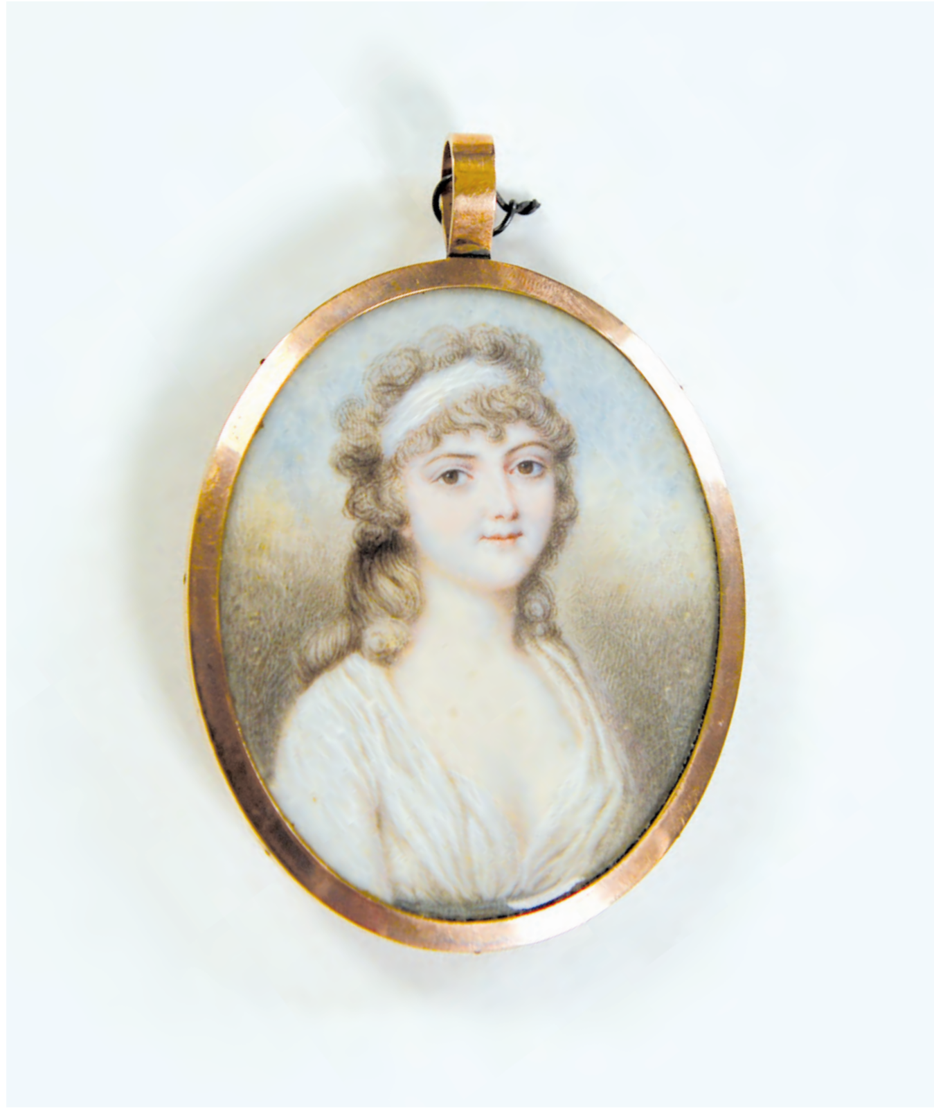
A miniature by Nathaniel Plimer, possibly depicting the Vicomtesse de Cambis (front).