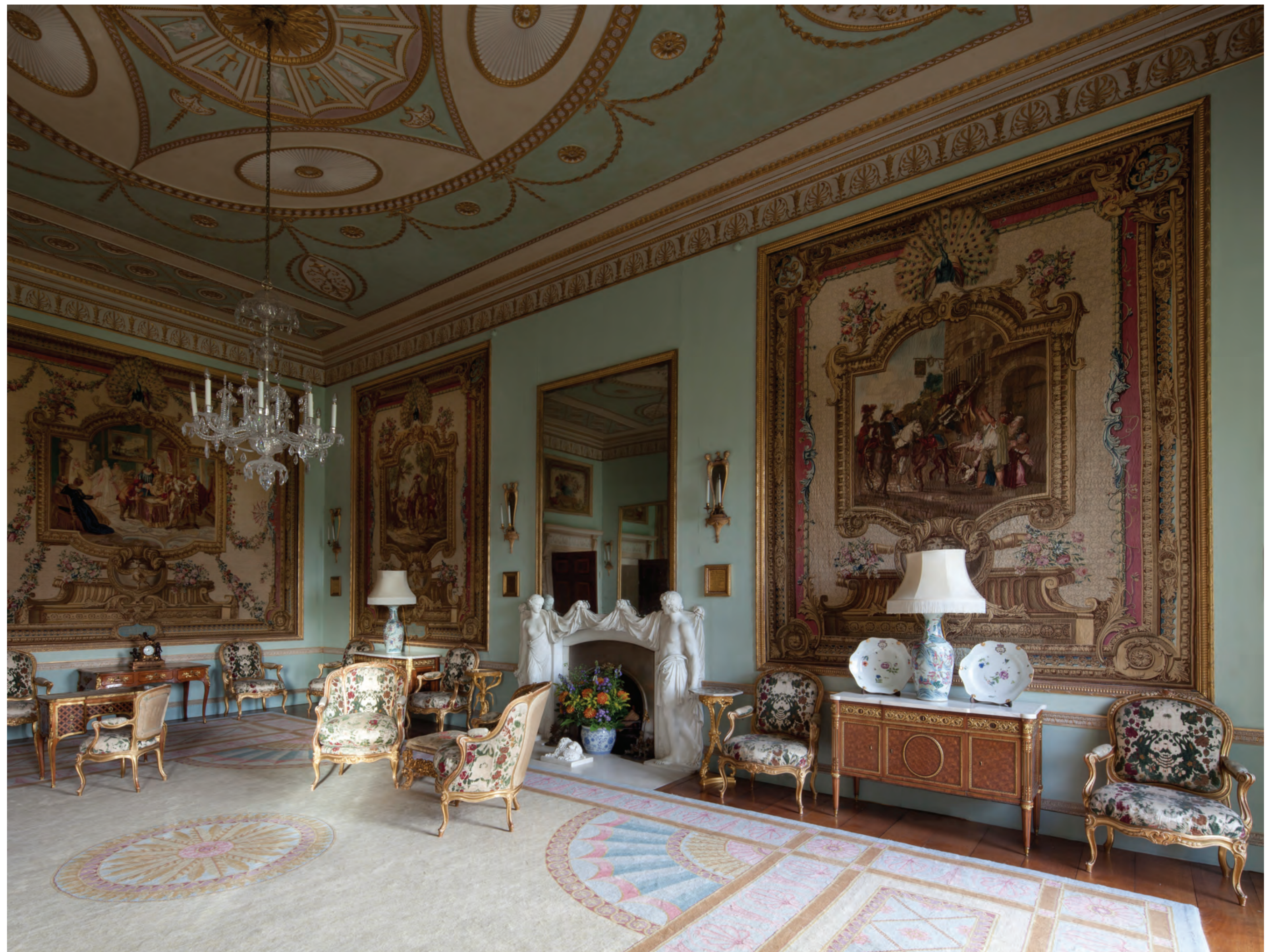
The Tapestry Drawing Room designed by James Wyatt