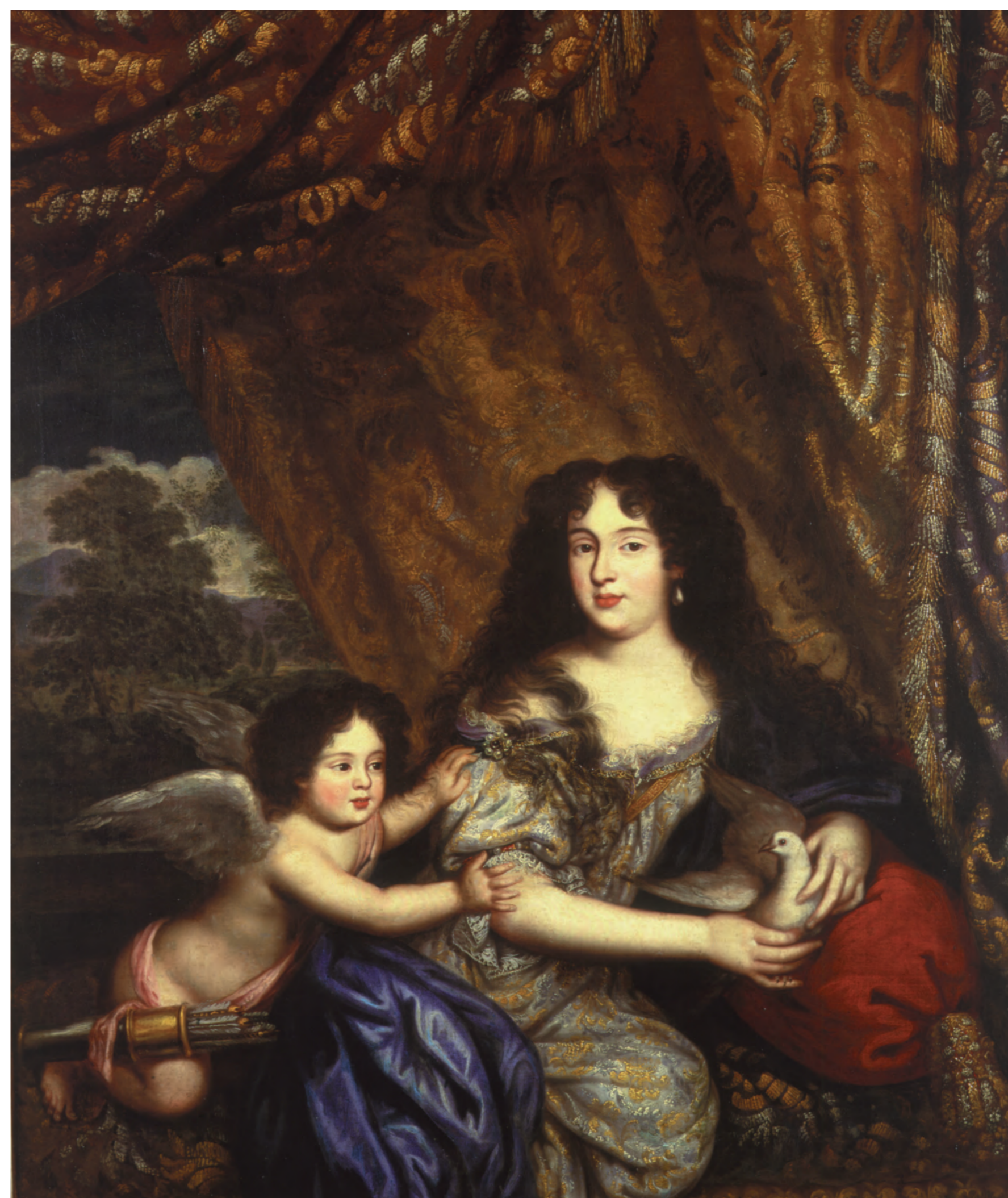
Louise de Keroualle, Duchess of Portsmouth, as Venus, with her son, Charles as Cupid by Henri Gascars.