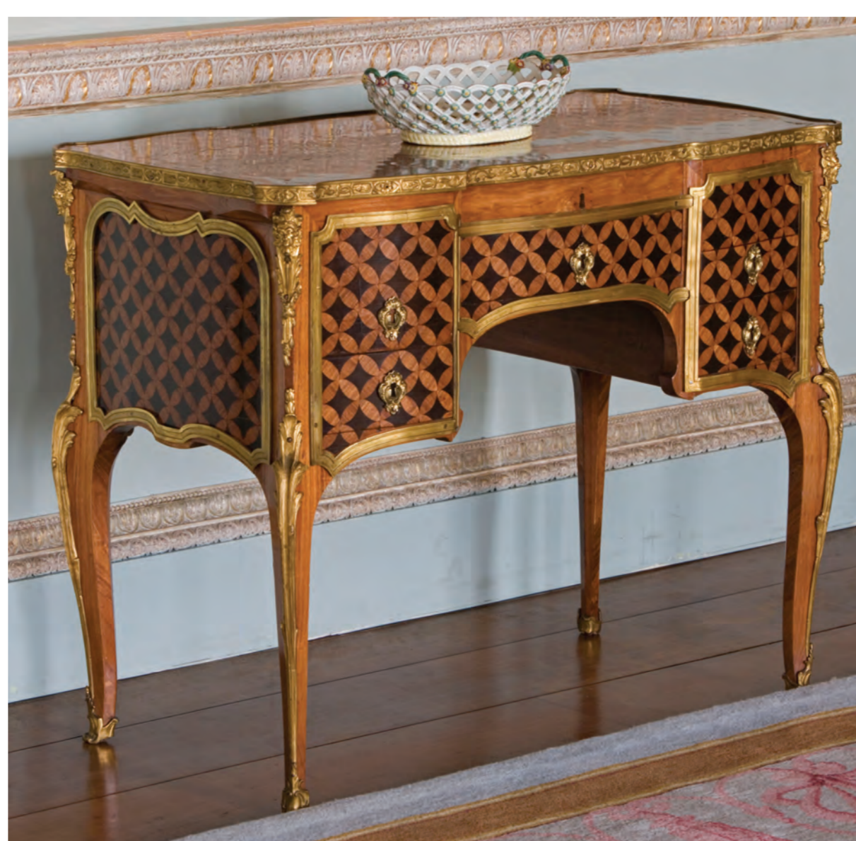
A Louis XV marquetry coiffeuse (lady's dressing-table) by Roger Vandercruse, circa 1770.