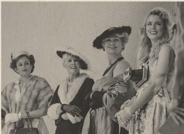
BEST DRESSED 2017.

Mastercard® is the proud presenting partner of Revival Fashion, a celebration of the iconic styles of the Revival where a look can Start Something Priceless™.