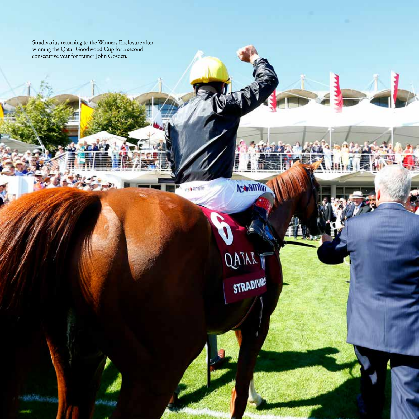
Stradivarius returning to the Winners Enclosure after winning the Qatar Goodwood Cup for a second consecutive year for trainer John Gosden.

“In terms of beauty in Europe, it’s hard to pick between Goodwood and Deauville.I think those two tracks are charming, historical. Goodwood with its panoramic view, and undulating course... it’s just a fantastic place.”